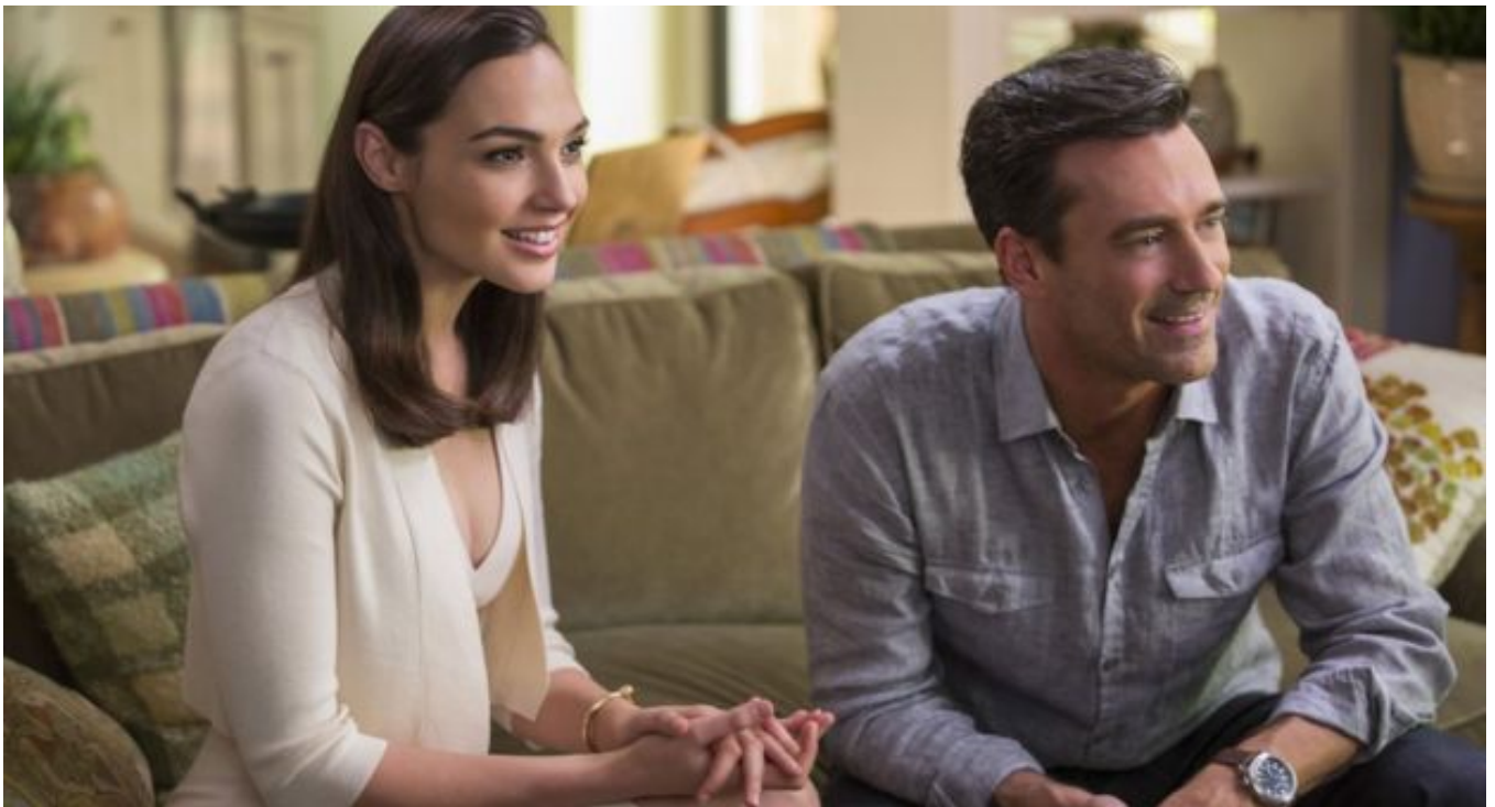
Gal Gadot and Jon Hamm star in Keeping Up With the Joneses

Further down the top 10, Keeping Up With the Joneses launched with a relatively disappointing $5.6m (£4.6m), landing at number seven.