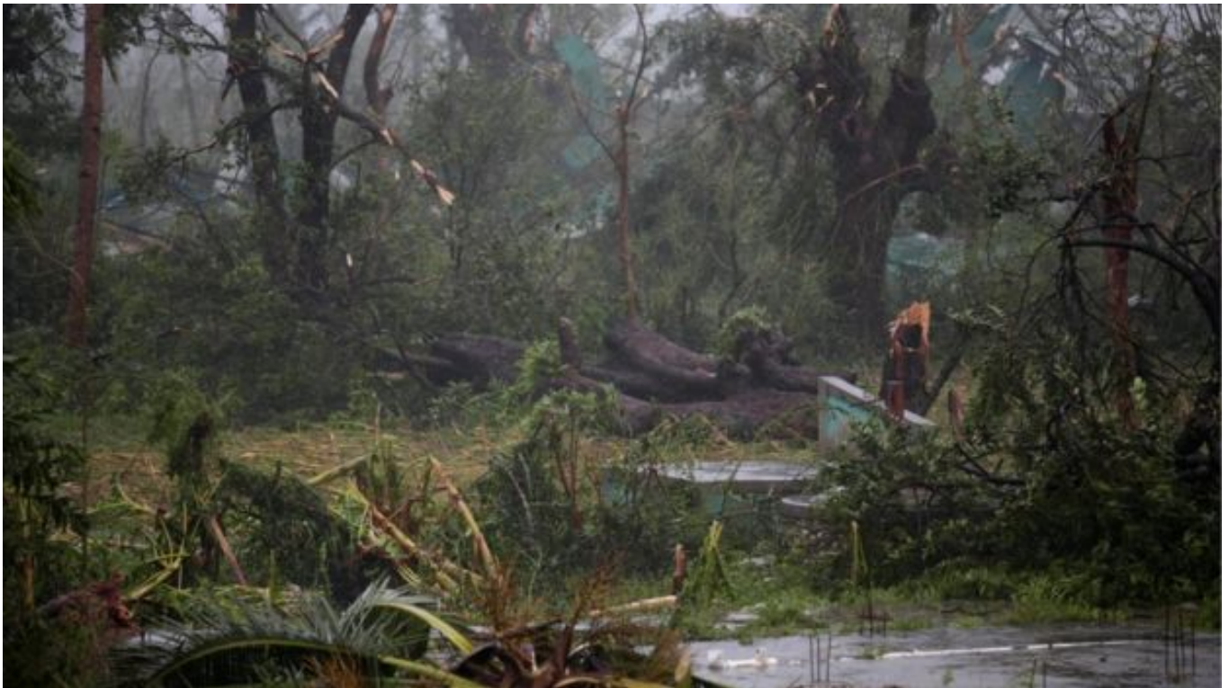
Damage in Les Cayes was said to be significant, but the extent of losses is still unclear