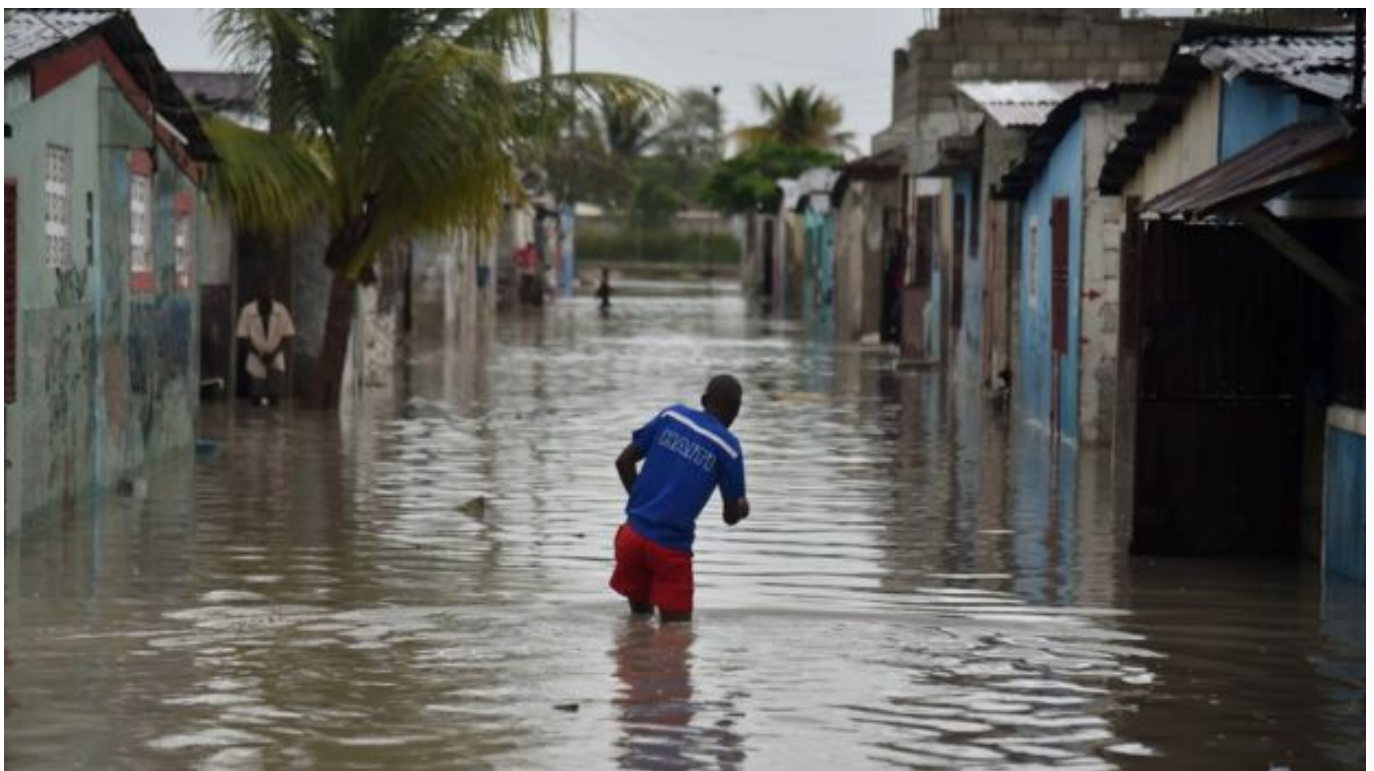
Parts of Port-au-Prince were flooded by the storm