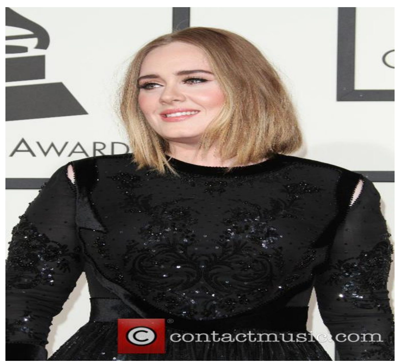
Adele's fans have come flocking following her upsetting Grammy performance

Following her uncomfortable performance at the Oscars of the music world, Adele admitted that she cried all the next day and was "so embarrassed".