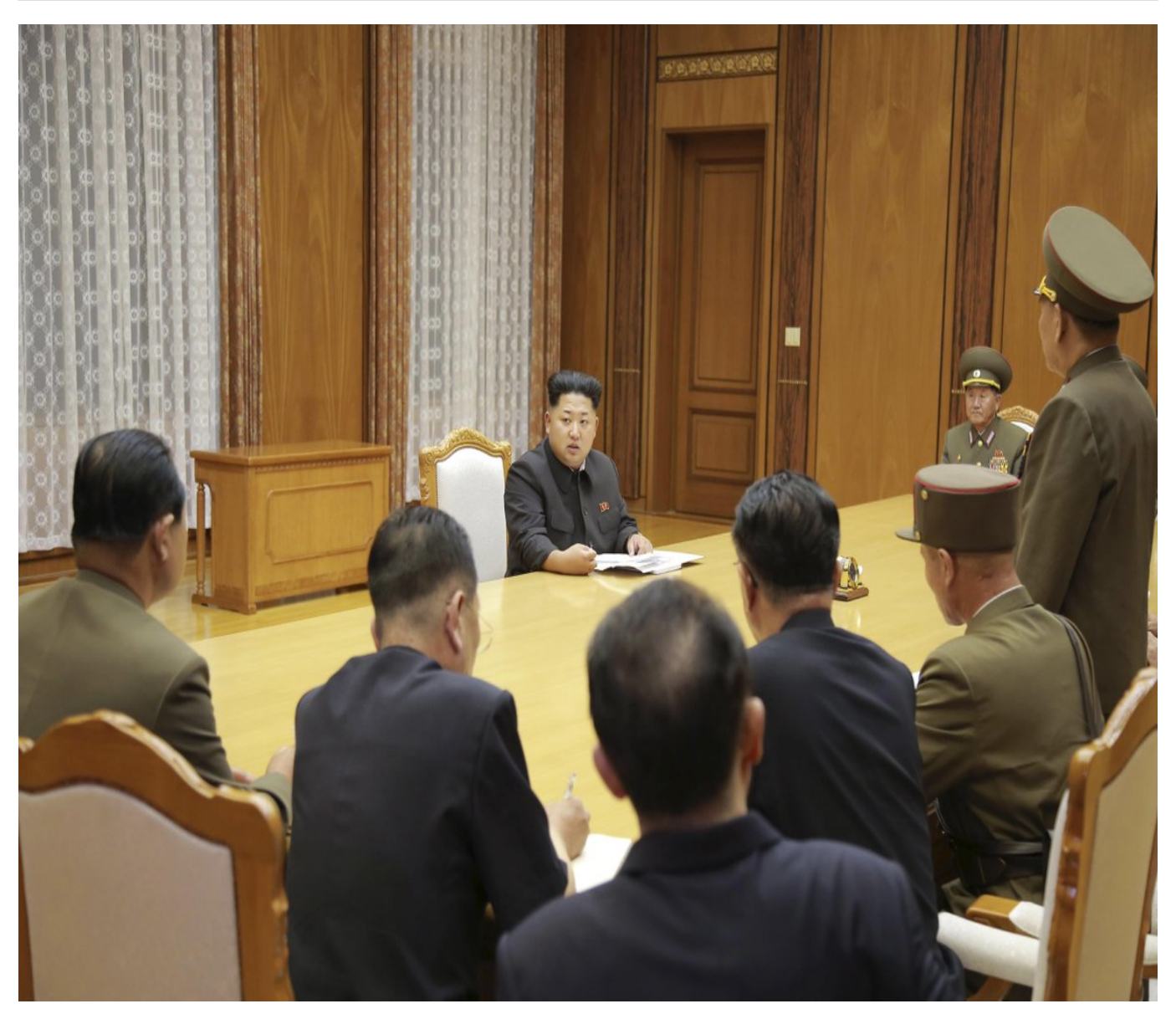
LATEST: Situation on Korean peninsula is close to war - #NorthKorea envoy to China http://on.rt.com/6pfq

South Korean President Park Geun-hye held an emergency meeting of the country's National Security Council ordering a "stern response" to any provocations from the North, as reported by AFP.