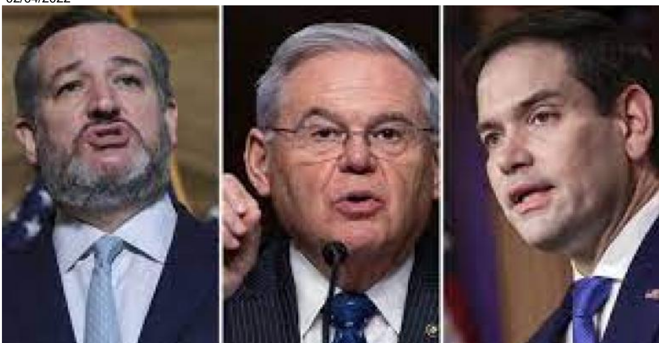
By: Arnaldo Musa / Special CubaSí 02/04/2022

The hysteria against the Cuban Revolution remains at the highest level in the United States, where lawmakers of Cuban origin and the wealthy counter-revolution controlling Florida continue to voice out their disrespect, and even more so when they cite from time to time that statement by Vice President Kamala Harris, who confirmed they will only lift the criminal blockade against the Island when those criminal elements allow it.