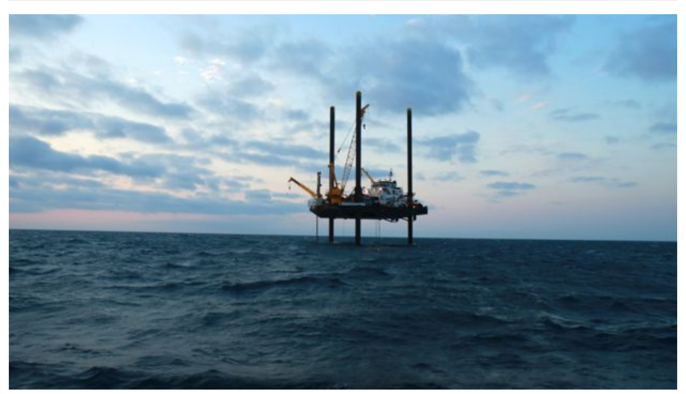
The drill rig was on station in the Gulf in April and May last year

The shallow sea covering the target site meant colossal volumes of sulphur (from the mineral gypsum) were injected into the atmosphere, extending the "global winter" period that followed the immediate firestorm.