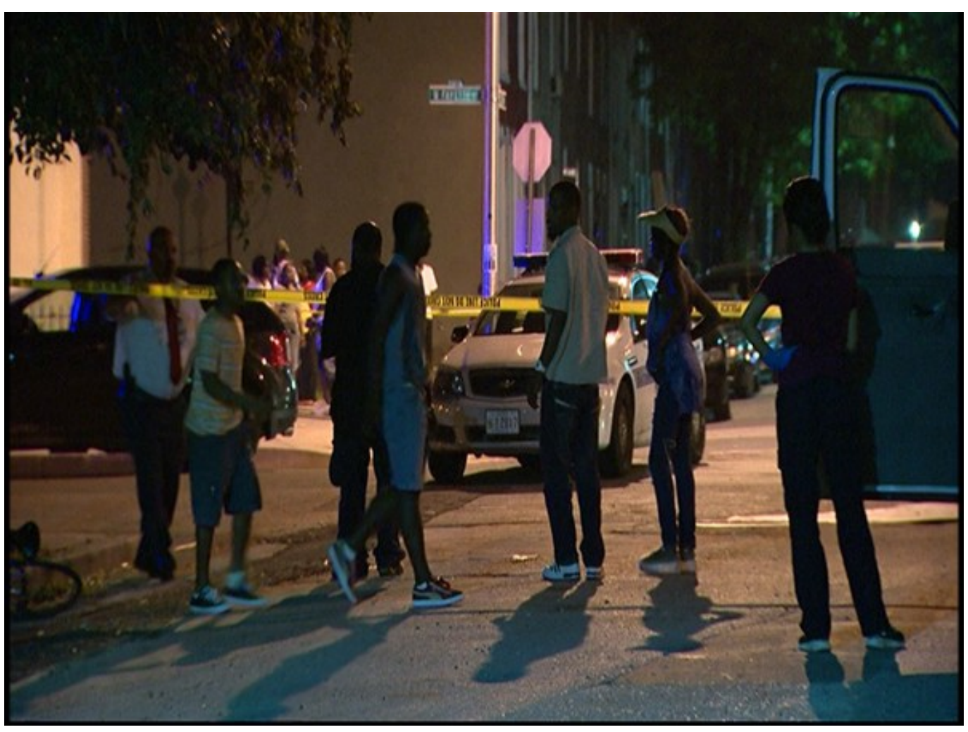
_The scene of Tuesday's shooting near the University of Maryland's Baltimorecampus.